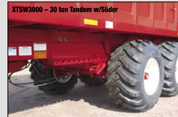
XTSW3000 – 30 ton Tandem w/Slider

Wide-Track Suspension Style Trailers XTSW2400 / 3000 / 4500 – 24, 30, 45 Ton Capacity Spring Suspensions – All Models / Oil Bath Hubs - XTSW2400 & 3000 Tire options include 600/50, 700/40 floatation or dual/single Truck Style Sliding Axle System standard on XTSW3000 Fixed on XTSW2400 & 4500