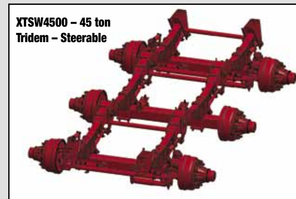
XTSW4500 – 45 ton Tridem – Steerable

Wide-Track Suspension Style Trailers XTSW2400 / 3000 / 4500 – 24, 30, 45 Ton Capacity Spring Suspensions – All Models / Oil Bath Hubs - XTSW2400 & 3000 Tire options include 600/50, 700/40 floatation or dual/single Truck Style Sliding Axle System standard on XTSW3000 Fixed on XTSW2400 & 4500