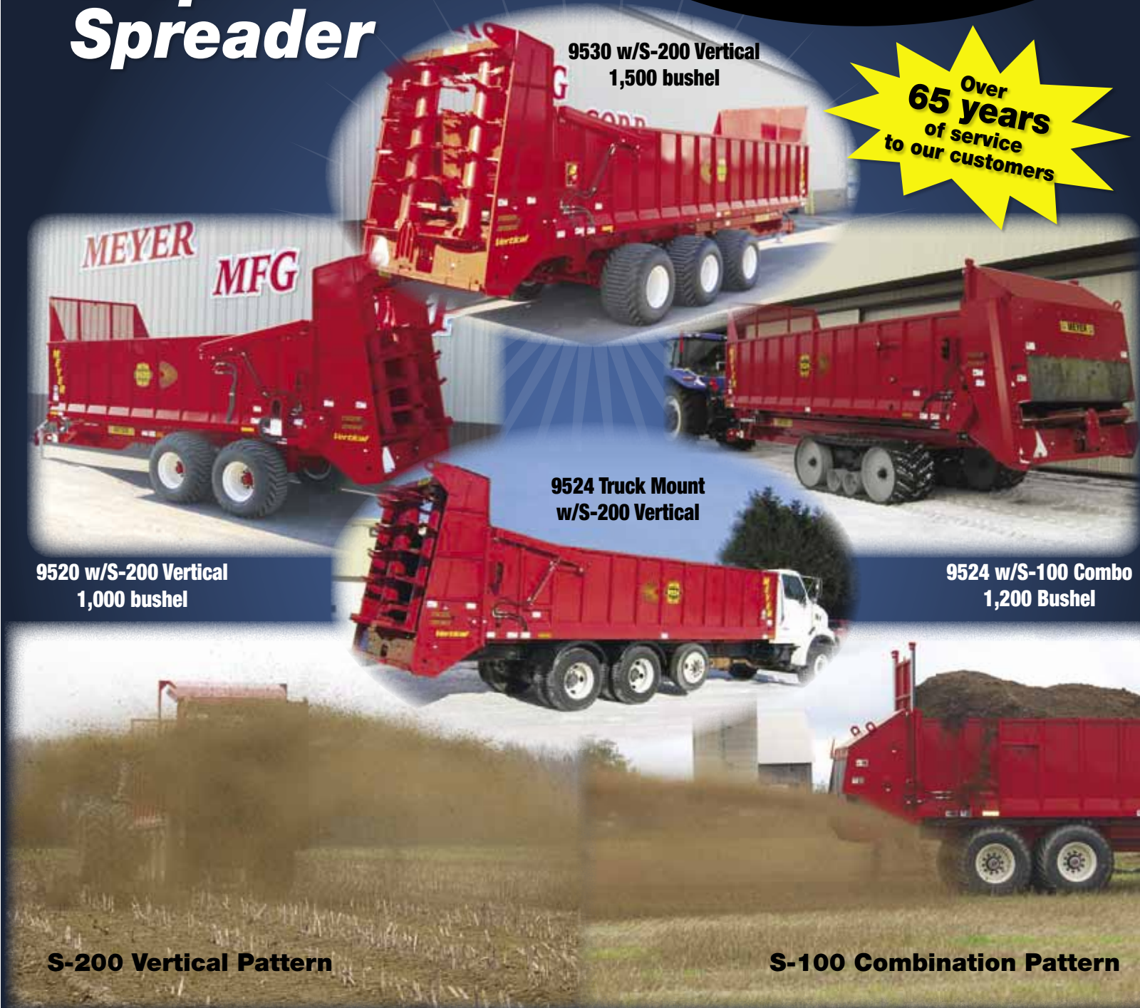
9530 w/S-200 Vertical 1,500 bushel

Over 65 years of service to our customers